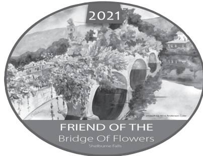
Top left: Plant Sale 2019; top center: “potting up for plant sale”; top right: solitary path; bottom left: holiday tree with seed decorations for the birds; above: new decal designed by Joan LaPierre for Friends of the Bridge of Flowers.