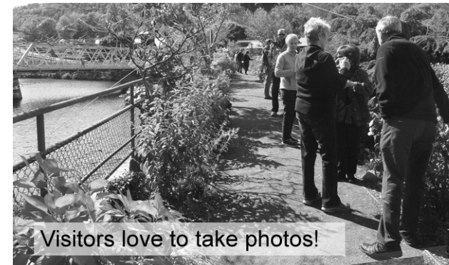
Visitors love to take photos!