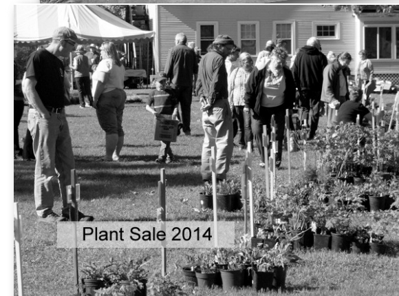
Plant Sale 2014

The floral displays on the Bridge often raise questions which continue to be answered by the Master Gardeners who are on duty several summer weekends. This is a different element of our outreach and we are happy to join the Master Gardeners in their mission of educating the public.