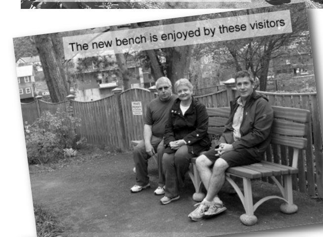
The new bench is enjoyed by these visitors